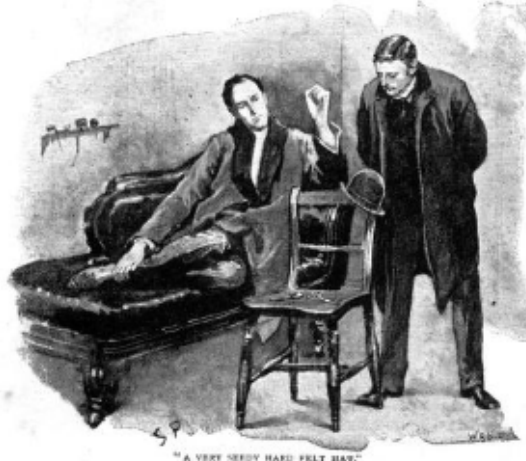
"A VERY SEEDY HARD FELT HAT."

when you have four million human beings all jostling each other within the space of a few square miles. Amid the action and reaction of so dense a swarm of humanity, every possible combination of events may be expected to take place, and many a little problem will be presented which may be striking and bizarre without being criminal. We have already had experience of such."